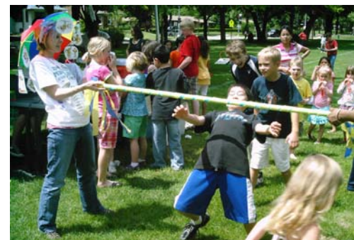
Kids enjoyed the limbo at our Summer Reading Kickoff Party in June.

It's back-to-school time again! Stocking up on school supplies can cost a fortune, but fortunately, the most important school supply of all won't cost you a thing. It's a library card! With your card, you can check out books and order hard-to-find items from other libraries, do online research for papers, or download