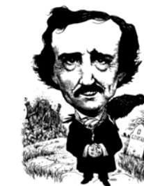
Edgar Allan Poe

The Big Read is coming! In October, the River Forest Public Library will participate in a grant-funded program called The Big