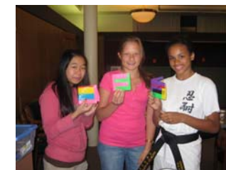
Teens got crafty and made wallets from duct tape during our Summer programs.

The 2009 Teen Summer Reading Program "Express Yourself @ Your Library" was a huge