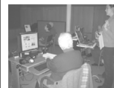
Patrons enjoyed the Photo Story class held in December.

Need a technology refresher? The River Forest Public Library is here to help. Free