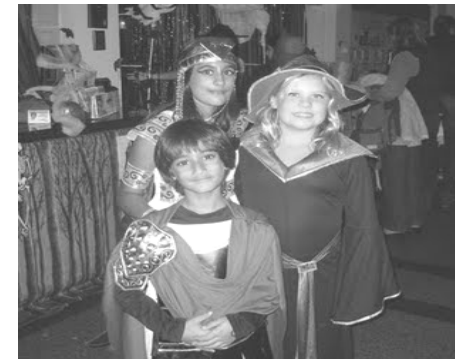
Everyone had a blast at Family Fireside Halloween on 10/21/09!

Donuts for Dads returns to the library this year from January 16-March 13. Bring the kids to the library on Saturdays from 9:30 a.m. until 12:00 p.m. for some quality family time at RFPL. Look at books, play some games, or work on crafts together. We'll have Blue Max coffee, donuts and other breakfast treats.