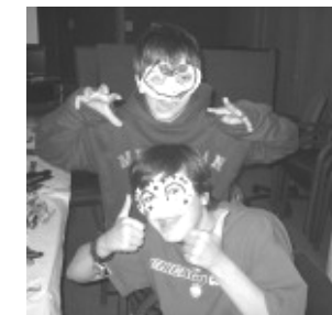
Teens made their own masks and other crafts during our Poe Big Read event on 10/1/09

Join us this winter for our first ever Teen Winter Reading Challenge! Our Winter Reading