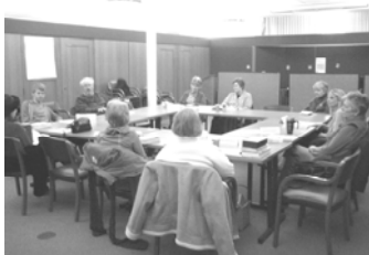
Our Afternoon Book Group

Do you enjoy book discussions? The River Forest Public Library hosts two regular book groups. Our evening book group is held on the first Wednesday of each