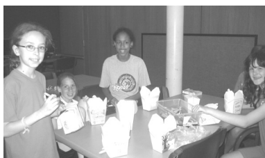
Teens created handmade soaps on June 18th.

River Forest Teens had a fantastic summer at the Library. Record numbers of teens signed up for Summer Reading and enjoyed many fabulous programs. The fun isn't over, though! Exciting things are happening for teens this fall at